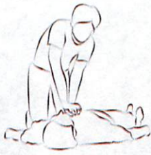
CPR & First Aid

One of SFCHC's nurses completed training through the St. Francois County Ambulance District in 2017 to become a Certified CPR and First Aid instructor. The Health Center began offering certification classes to the public in November.